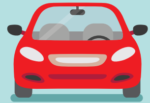
A red car