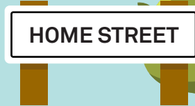
A street sign