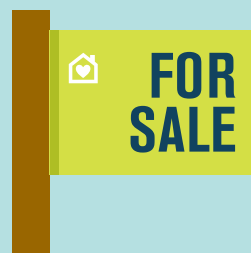
A 'for sale' sign